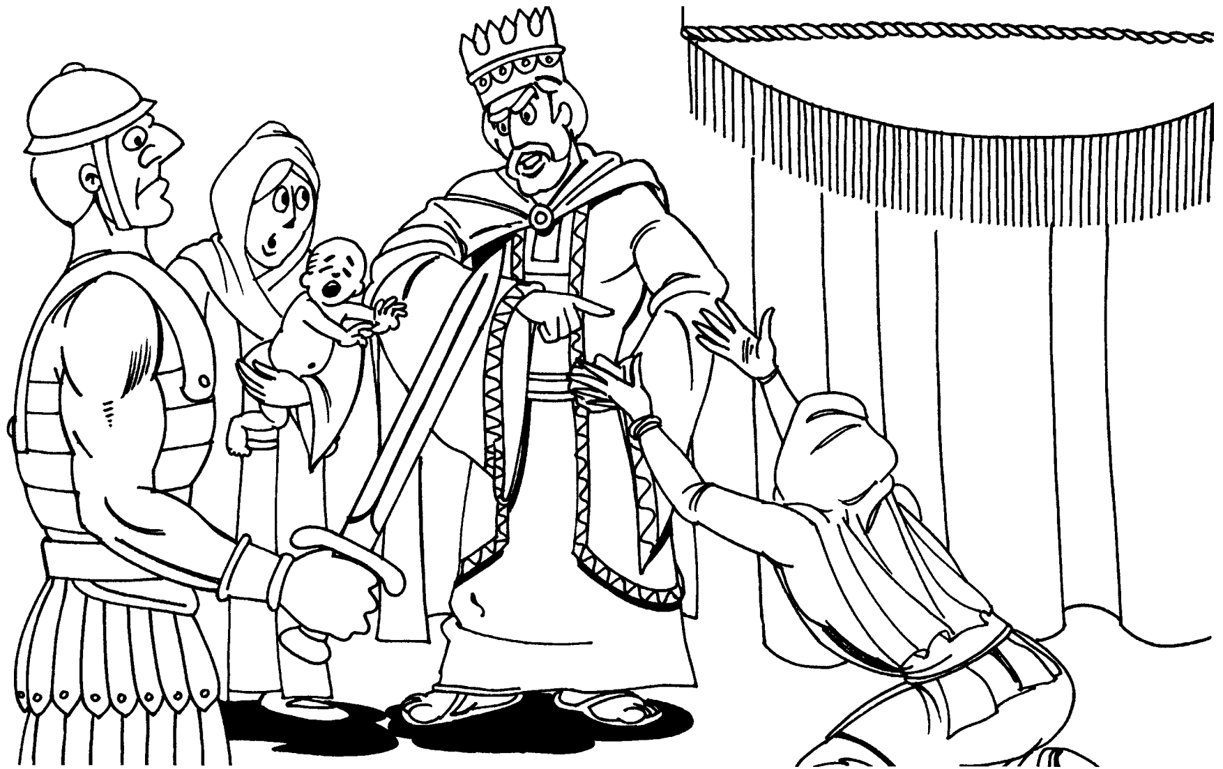
King Solomon 414

King Solomon then did a very strange thing. He told a soldier to cut the living baby in half so that each woman could have some of the baby. The real mother pleaded for the king not to hurt the baby but give it to the other woman. The other woman told the king to cut it in half. Now who do think was the real mother? With Godly wisdom the answer is easy. Solomon gave the baby to the woman who was prepared to give the baby away to save its life.